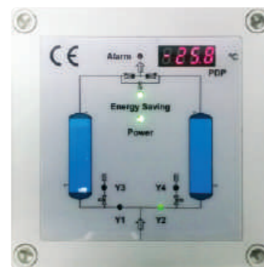
HDC1 Digital Dewpoint Display

AIRLANE making PNEUMATICS WORK for you 32D ELLESMERE COURT, LEECHMERE INDUSTRIAL ESTATE SUNDERLAND SR2 9UA Tel: 0191 5214140 Email: sales@airlane.co.uk www.airlane.co.uk